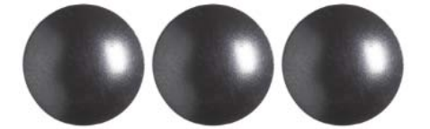
#27 3/4" Smoke