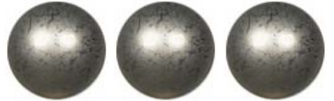
#9 3/4" Pewter