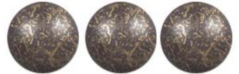
#6 3/4" Old Gold