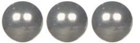
#15 3/4" Nickel