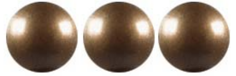
#3 3/4" Old Brass