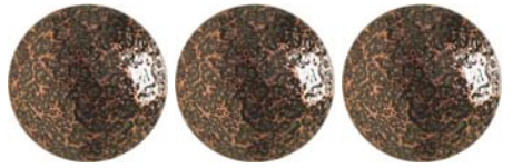
#24 3/4" Bronze